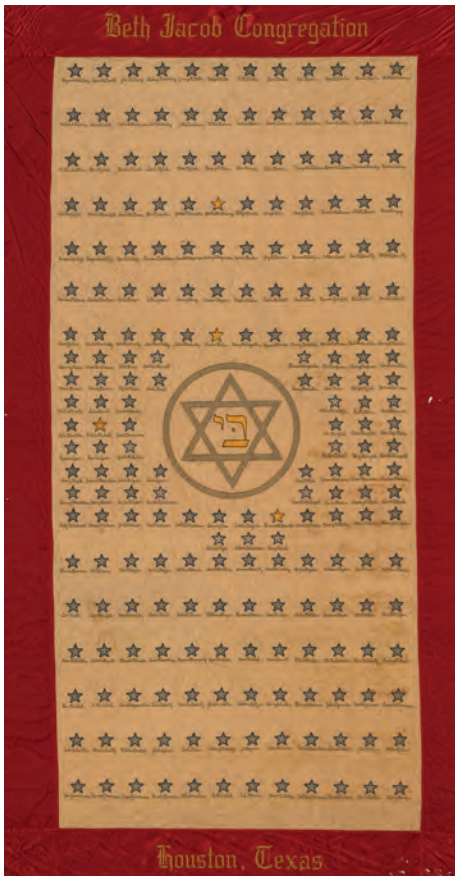
World War II silk banner featuring veterans' names from Houston's Beth Jacob Congregation, with detail of damage. The banner is currently undergoing restoration and will return to Fondren Library, ready for research, in 2019.