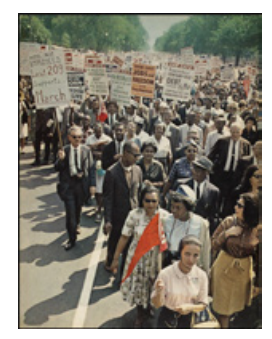
March on Washington, 1963

As more information is transferred to digital format, vast numbers of written pages have been opened up to scholarly examination. Digitization has dramatically increased the ease with which multivolume works (newspapers, journals or archives) in all disciplines can be stored and accessed. It is helping libraries to conserve valuable shelf space and make research possible at any time of day regardless of geographical distance from the originals. Digital resources can also be costly, some of our purchases hitting the six-figure mark. Here are some of our more recent purchases.